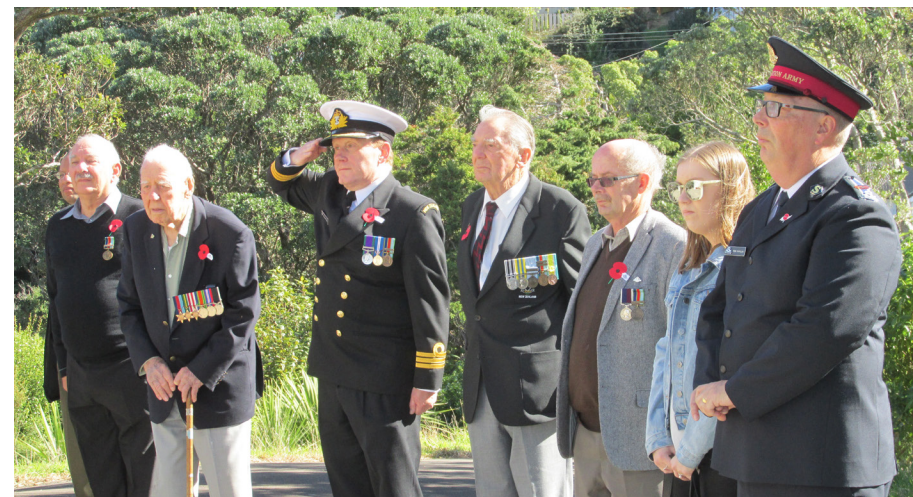
WW1 Memorial gathering for the Last Post

wreath laying ceremony took place at the WW1 memorial on Sugarloaf Hill with a bugler playing the last post. Thanks to everyone including all the volunteers who made this annual occasion a success, and to the neighbouring Brooklyn Scout Group for their food preparation. Earlier in the week 65 children in our school holiday programme made ANZAC biscuits during a day of baking on Monday followed by a trip during Tuesday to The Great War Exhibition by Sir Peter Jackson.