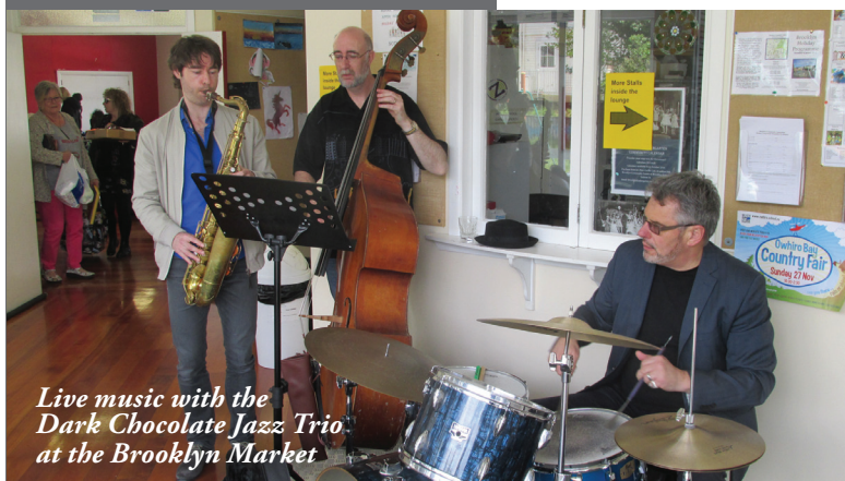
Live music with the Dark Chocolate Jazz Trio at the Brooklyn Market

Copy due by 5pm, Friday 24 March 2017 for the April Brooklyn Tattler Email your contribution to: brooklyntattler@gmail.com