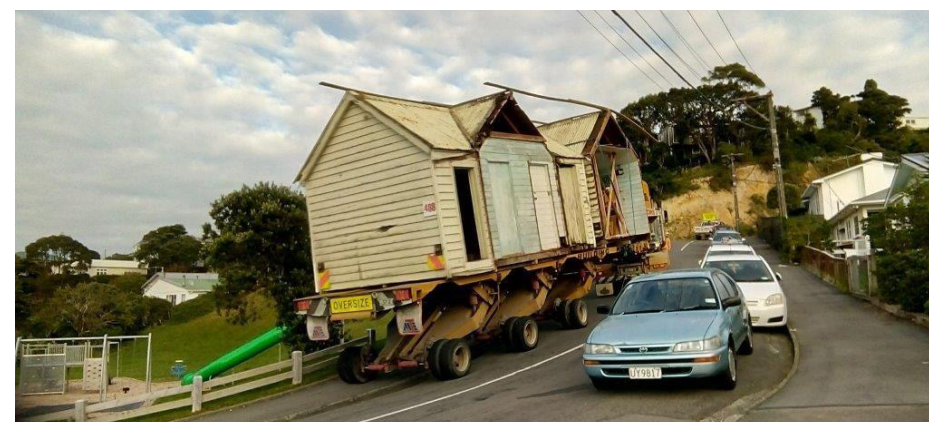
Easy does it. A Brittons Housemovers truck moving cautiously up Krull Street on 28 June. The house was relocated to nearby Mana Street.