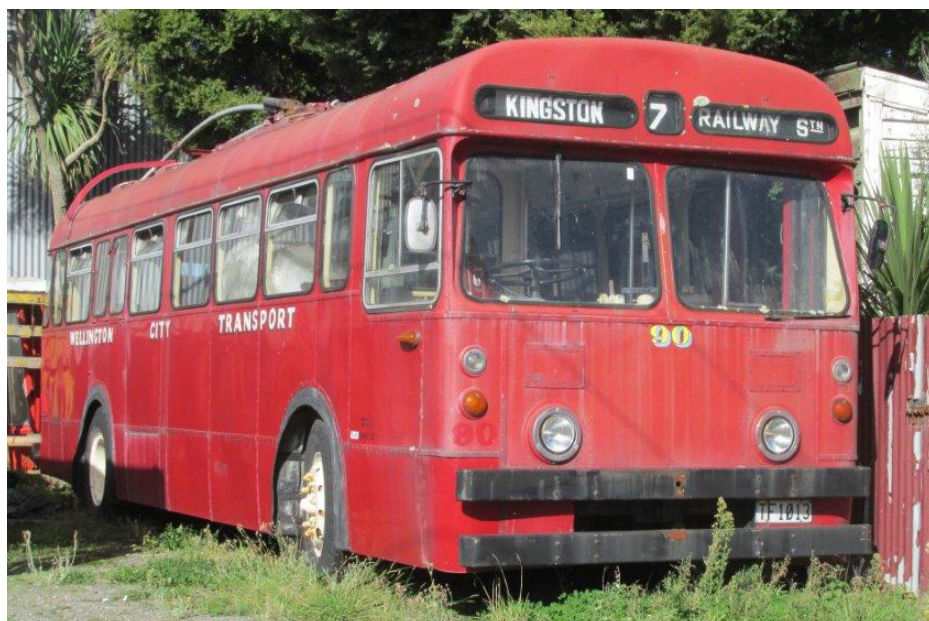
Wellington's iconic "Big Red" bus; No.7 to Kingston

https://www.metlink.org.nz/on-our-way/wellington-city/2018-wellington-bus-network-by-suburb/brooklyn/