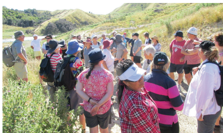
Participants in Whangawehi guided walk

Mahia Maori Committee, Wairoa District Council, Hawkes Bay Regional Council, and the majority of the landowners who border the stream. A magnificent effort! And one that has earned them several awards, plus the recommendation that their unique collaborative approach should be used as a template for other areas. Besides monitoring the waste water treatment, they are doing water monitoring, riparian planting, pest control, and progressively retiring and fencing the stream borders.