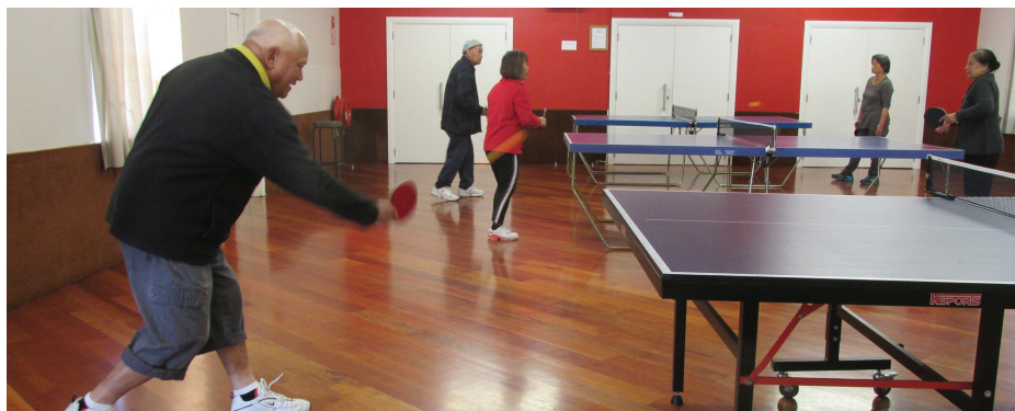
Table Tennis for all ages and abilities. Tuesdays at 9am and Wednesdays at 8pm. Monthly markets are back again from Saturday 27 February from 9:30am to 1pm.