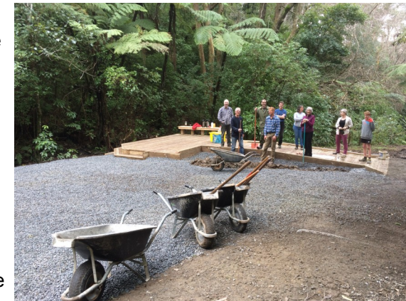
Break time at the working bee!