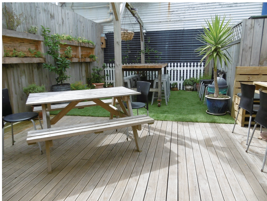
Where is this?