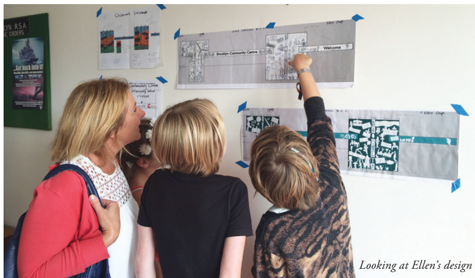
Looking at Ellen's design

For more on the Mural Project go to: http://brooklyncommunitycentre.org.nz/